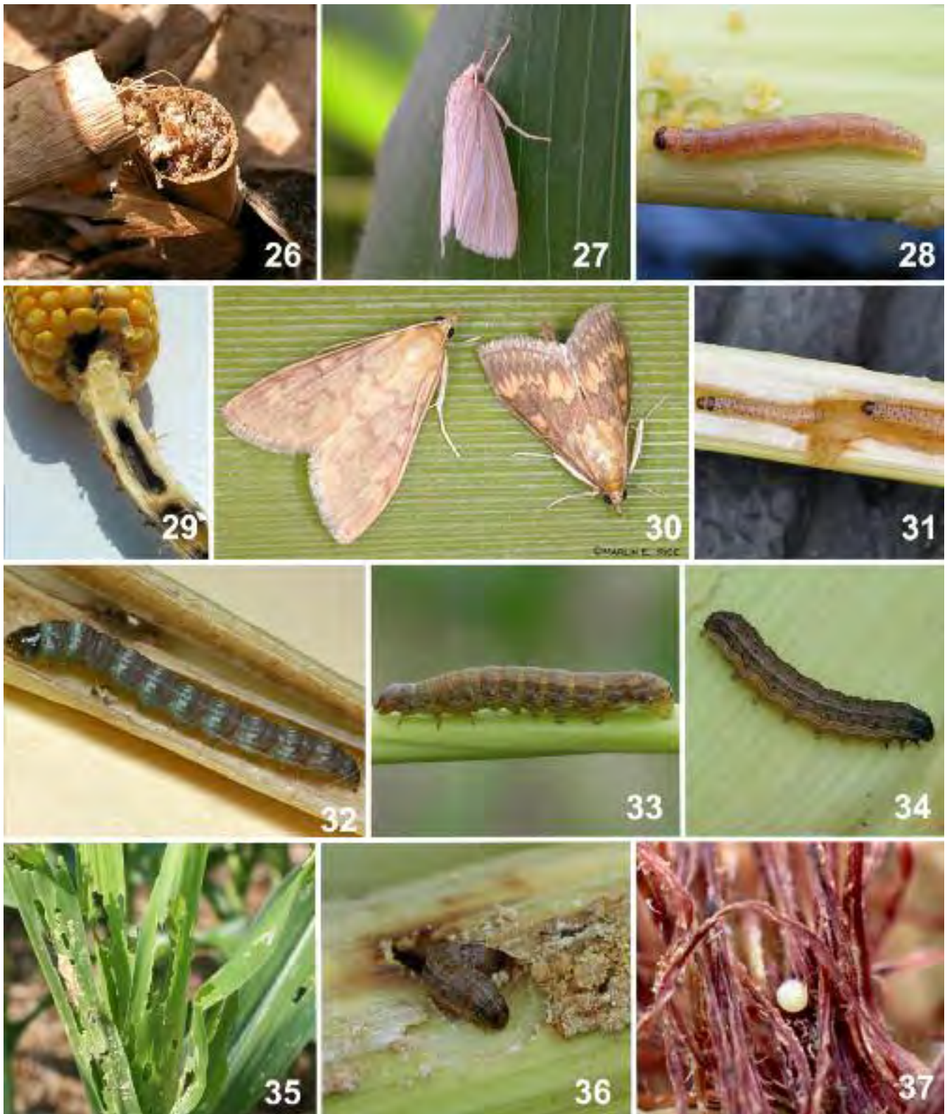
Figures 26-37. Girdled Stalk by Southwestern Corn Borer (26), Southwestern Corn Borer Moth (27), European Corn Borer Larva (28), Ear Shank Tunneling by European Corn Borer (29), Female and Male European Corn Borer Moths (30), Sugarcane Borer Tunneling Stalk (31), Lesser Cornstalk Borer Larva (32), True Armyworm Larva (33), Fall Armyworm Larva (34), Fall Armyworm Damaged Whorl (35), Fall Armyworm Larvae in Ear Showing Inverted Y on Head Capsule (36), Corn Earworm Egg on Silks (37).