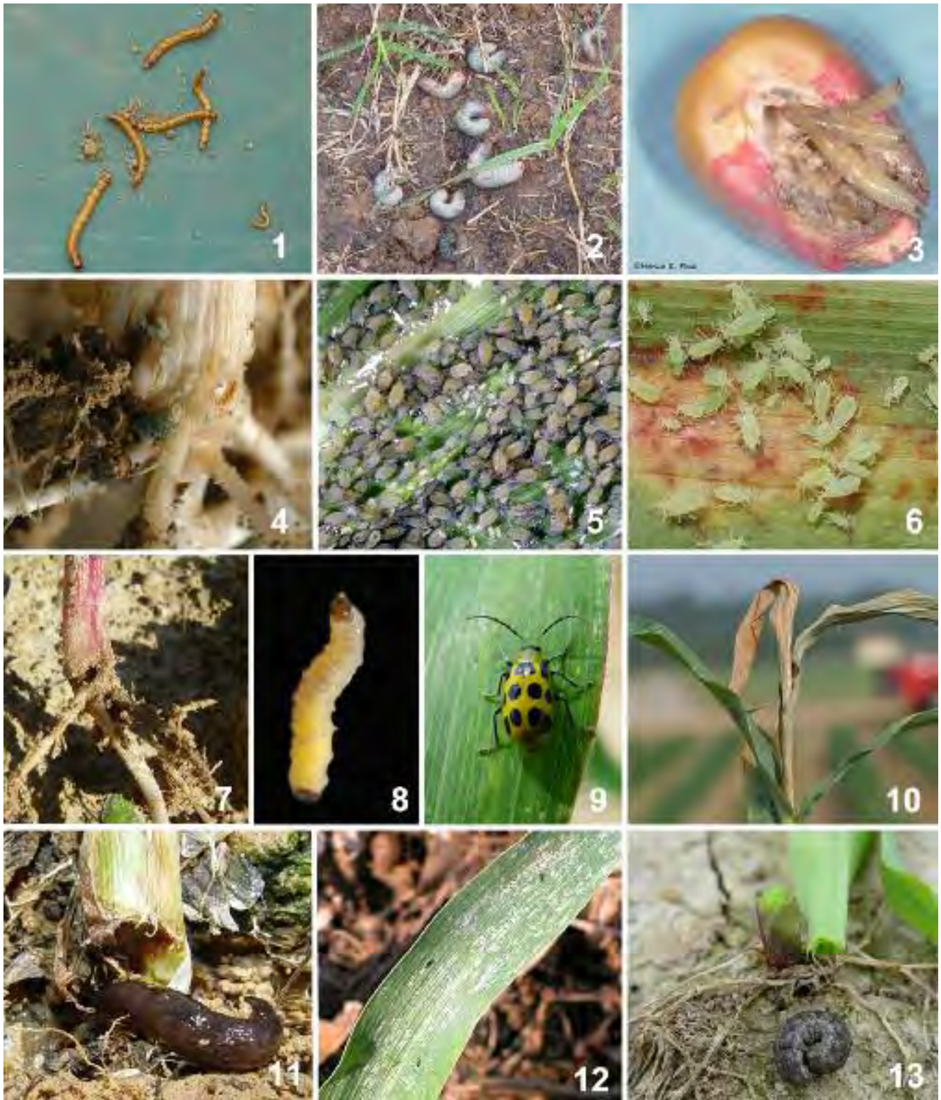
Figures 1-13. Wire Worms (1), White Grubs (2), Seedcorn Maggot (3), Corn Root Aphid (4), Corn Leaf Aphids (5), Greenbugs (6), Southern Corn Rootworm Damage (7), Southern Corn Rootworm Immature (8), Southern Corn Rootworm Adult (9), Dead Heart Plant From Southern Corn Rootworm Feeding (10), Slug (11), Thrips Injury (12), Black Cutworm and Damage (13).