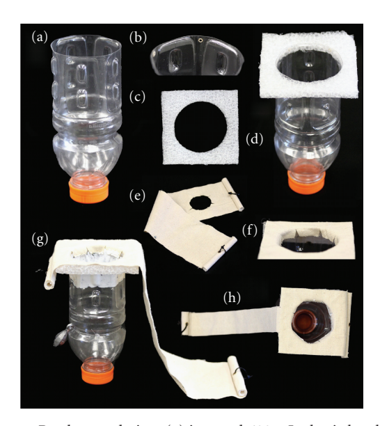
FIGURE 7: Bottle trap design: (a) inverted 600 mL plastic bottle, (b) hole bored into base of bottle, (c) foam square cut to bottle base, (d) foam square place around bottle base with fishing line tied through holes and around square, (e) canvas strip, with hole, slits around hole, dowels at each end, and zip-ties added, (f) canvas attached to inside of bottle with hot glue (g) fishing weight added to bottle with fishing line, and (h) excess canvas trimmed from foam square.

each arboreal trap was brushed with liquid Teflon (Dupont Polymers, Wilmington, Delaware) to prevent ants from escaping. Canopy traps were set in the trees using the same slingshot method as Kaspari [19]. However for ease of sampling and returning the traps to the canopy, the tie-down lines were tied together to make a loop similar to the methods