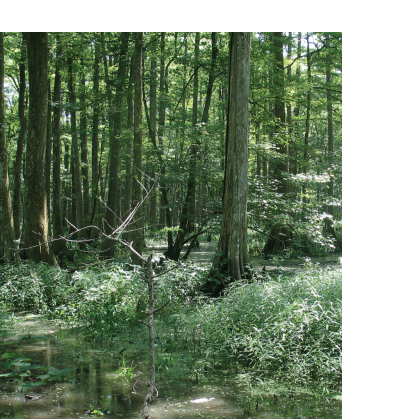
FIGURE 4: Cypress-tupelo swamp in Maurepas Swamp Wildlife Management Area, Saint James Parish, Louisiana.

(Figure 4). All locations are within the Mississippi River deltaic plain in coastal Louisiana.