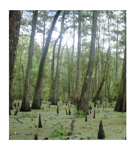
FIGURE 2: Cypress-tupelo swamp north of Gramercy, Ascension Parish, Louisiana.