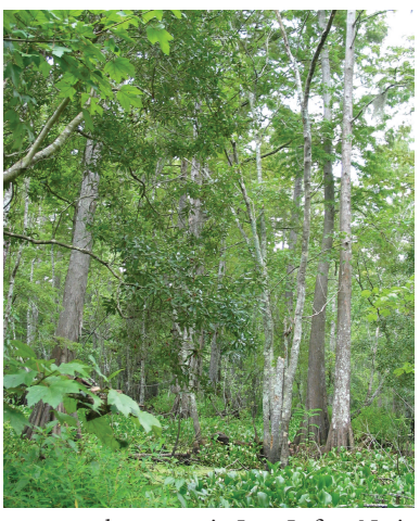
FIGURE 3: Cypress-tupelo swamp in Jean Lafitte National Historical Park and Preserve, Jefferson Parish, Louisiana.