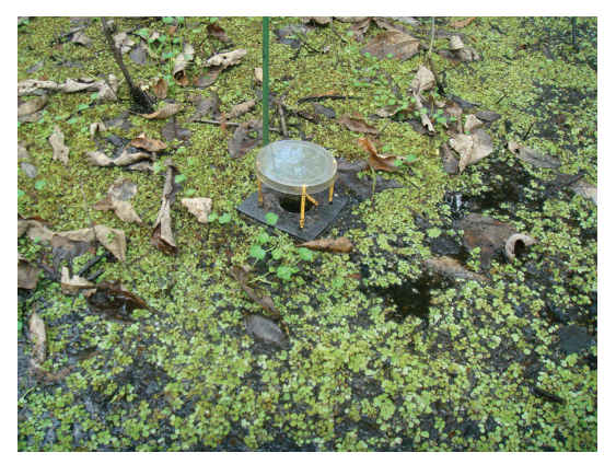
FIGURE 5: Floating pitfall trap shown floating on surface of water in cypress-tupelo-blackgum freshwater swamp.

4.1.2. Cup Trap (Figures 6(a)-6(e)). We modified a trap that was originally described by Oliveira-Santos et al. [18]. Cup traps were constructed from a single 400 mL tricorner plastic beaker (Figure 6(a)). Three holes were bored into a flange