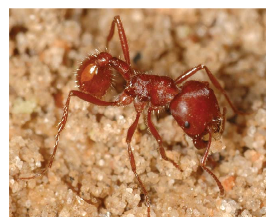
Figure 1. A worker of Pogonomyrmex badius.

Pogonomyrmex badius (Fig. 1) differs from most other Pogonomyrmex species in that it has a polymorphic worker caste, which includes minor, media, and major workers, with the major workers possessing enlarged heads and mandibles modified for crushing seeds (Cole 1968). Queens and workers have stingers, and although they are not aggressive, their sting is considered by some to be among the most painful of all North American ants. Workers of this species usually lack propodeal spines.