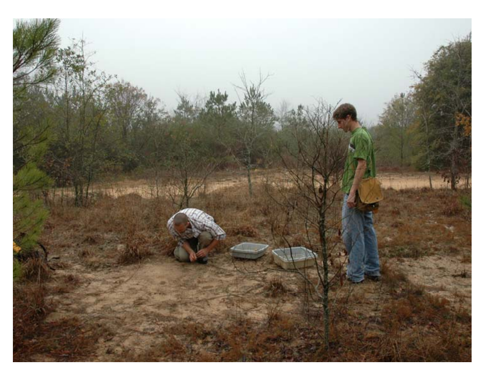
Figure 2. Site 1, in Smith County, Mississippi, showing the relatively open habitat where the first Pogonomyrmex badius colony was found.

sites 3 and 4 on 23 February 2007. Diameters of craters of all colonies and heights of craters at sites 1 and 2 were measured. Representative samples of germinating seeds, viable ungerminated seeds, and charcoal pieces that were found on the craters of each colony were collected. A representative sample of pebbles found on the crater at site 2 was collected. The colony at site 2 was excavated to a depth of approximately 1.52 m, and seed caches that were found were collected for later identification.