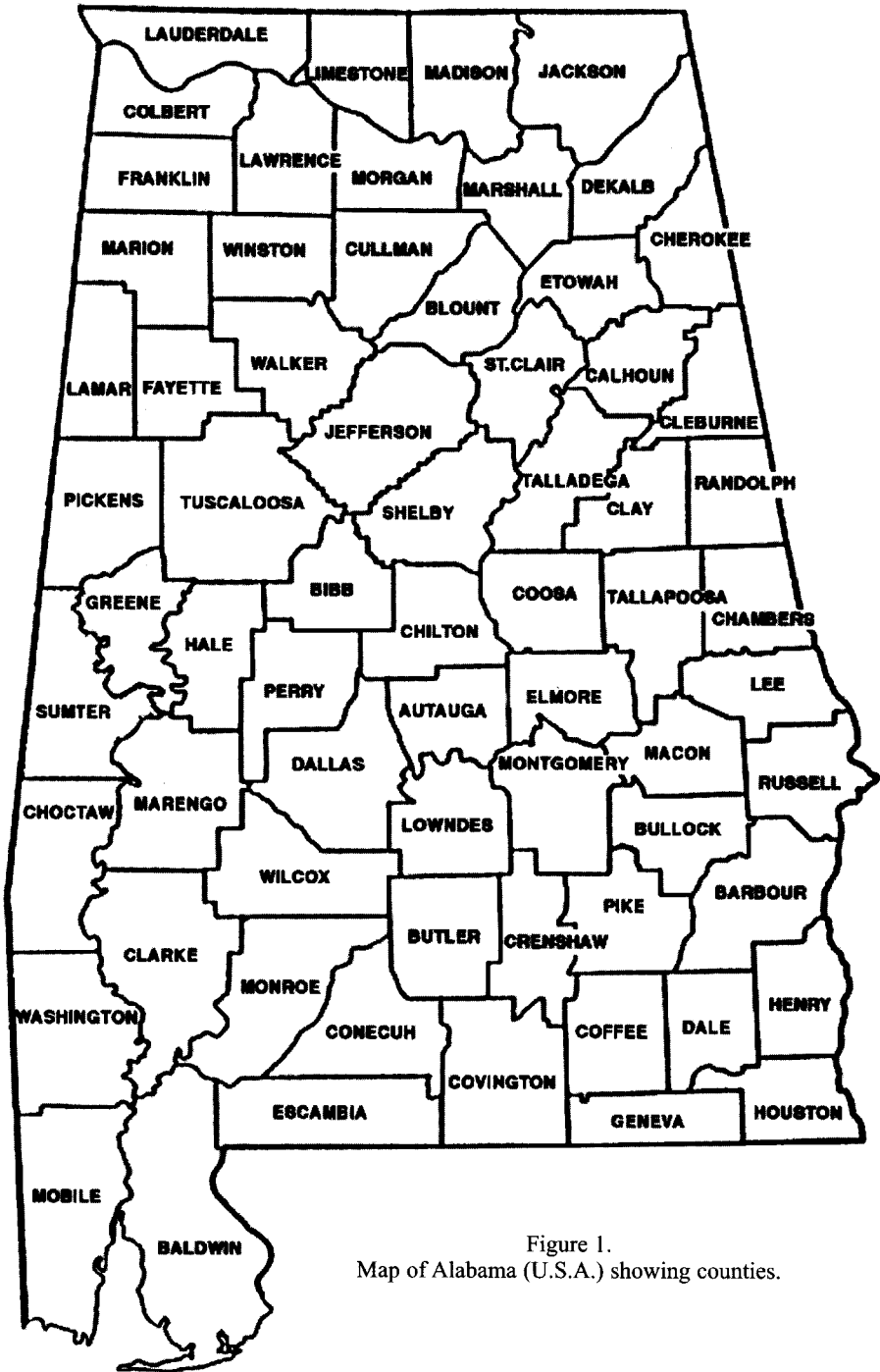
Figure 1. Map of Alabama (U.S.A.) showing counties.